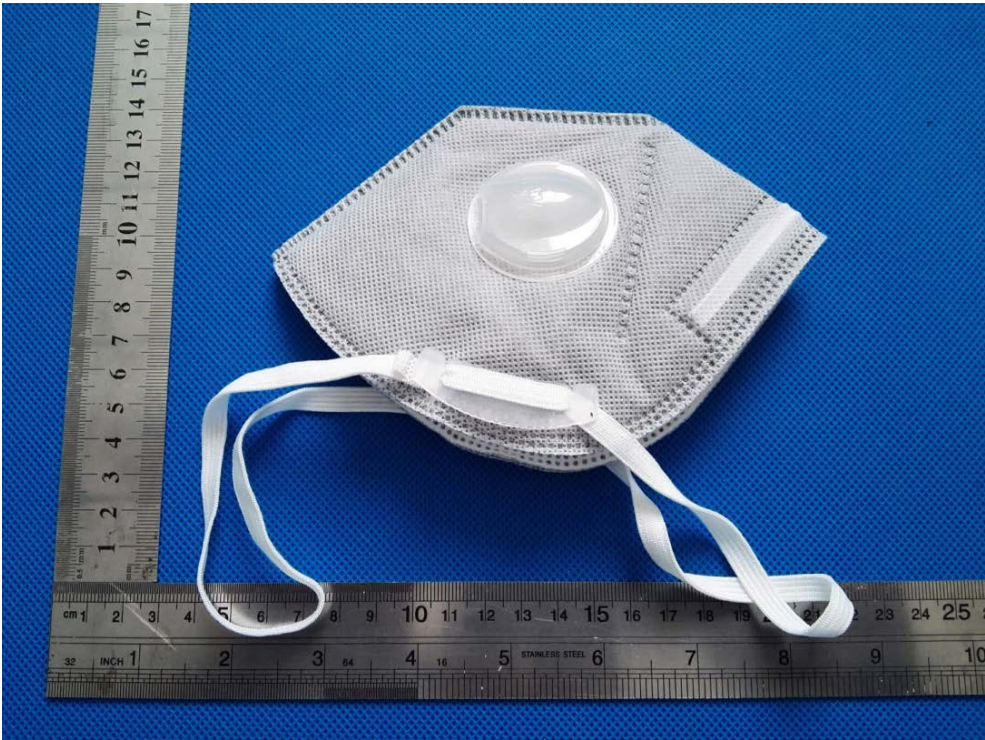
Photo 2 Inside of EUT